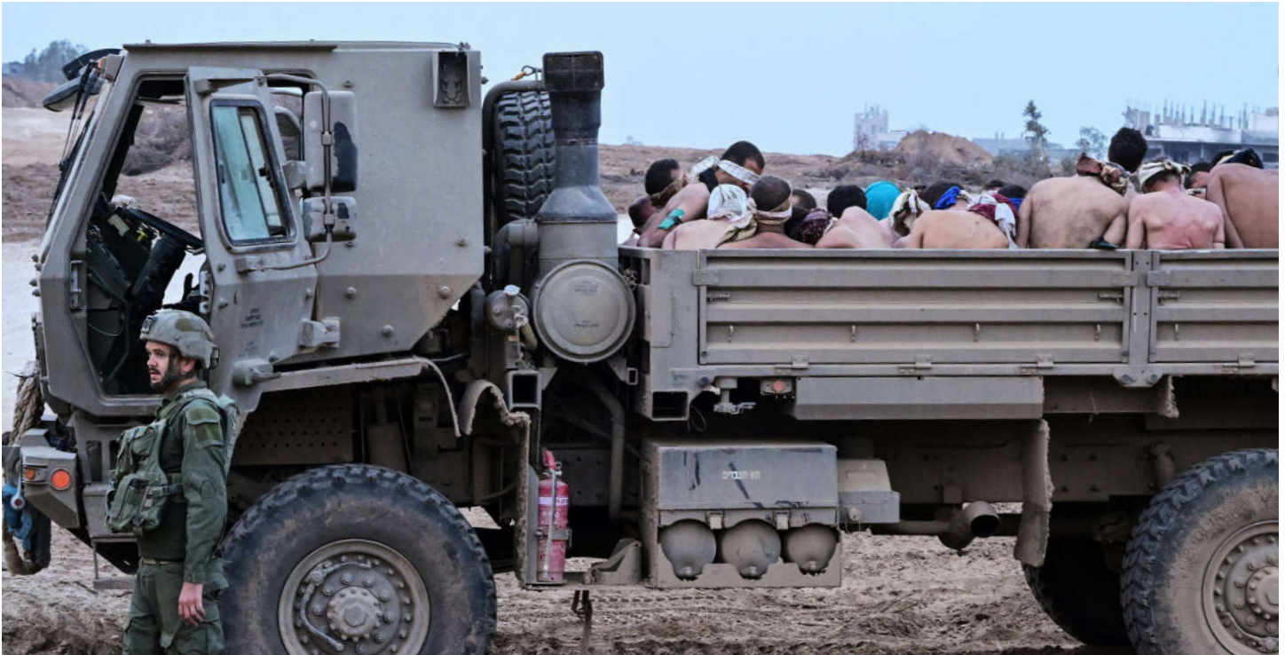
An Israeli soldier stands by a Oshkosh tactical vehicle with Palestinian detainees, Gaza Strip, December 8, 2023.