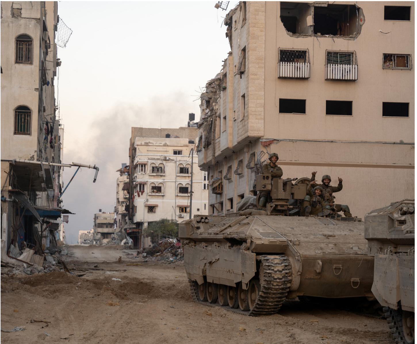
Israeli soldiers are seen on a Namer APC near Palestine Square in Gaza City's Rimal neighborhood. December 19, 2023.